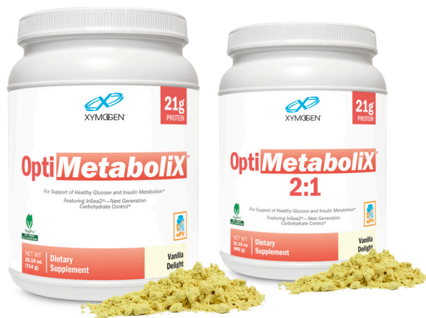
OptiMetaboliX is available in Chai, Chocolate Mint, and Vanilla Delight OptiMetaboliX 2:1 is available in Vanilla Delight

For Support of Healthy Glucose and Insulin Metabolism* Featuring InSea 2 ®—Next Generation Carbohydrate Control*